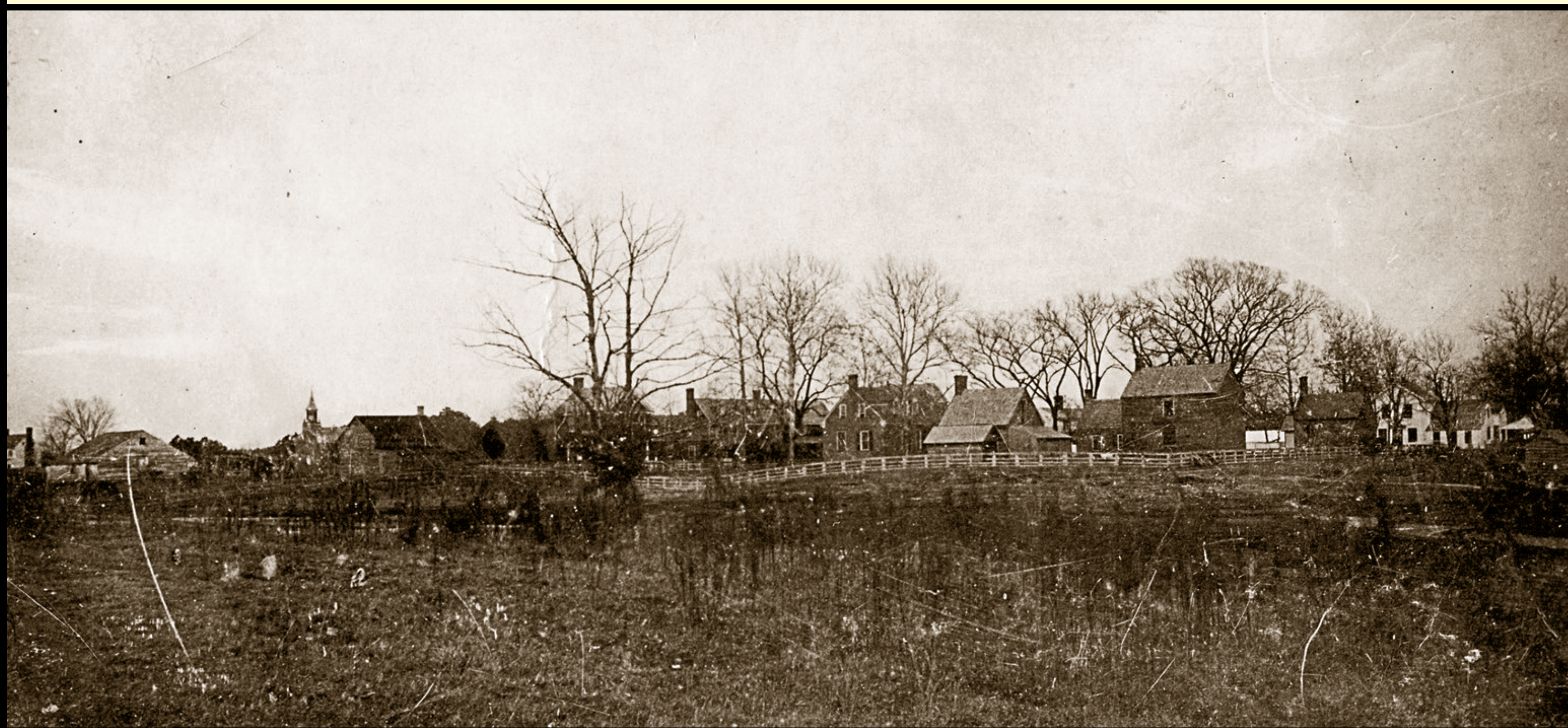
Mathews County Courthouse, photo ca. 1894

and destroyed the Federal schooners Golden Rod , Coquette , and Two Brothers . During the same summer, the Confederate Marine Coast Guard operated from nearby Horn Harbor under Beall. The men cut the underwater cable between Cherrystone Inlet and Old Point Comfort, destroyed all the equipment at Cape Charles Lighthouse, and captured at least six Union ships. Gen. Isaac J. Wistar and Lt. Commander James H. Gillis led a Union army-navy task force here in October 1863 to suppress the Confederate raids.